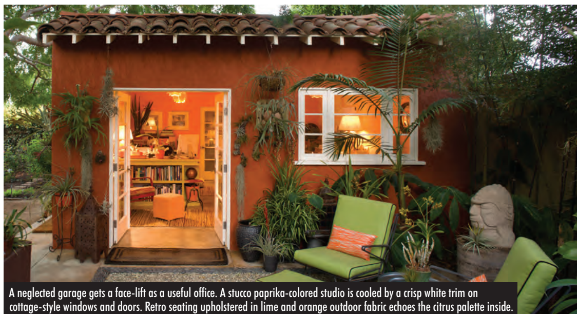
A neglected garage gets a face-lift as a useful office. A stucco paprika-colored studio is cooled by a crisp white trim on cottage-style windows and doors. Retro seating upholstered in lime and orange outdoor fabric echoes the citrus palette inside.