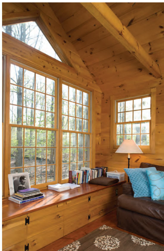
A trio of double-hung windows creates a glass wall offering an award-winning writer a constant perspective of nature outside. The 14-foot-long pine bench has storage cabinets and serves as an ideal work surface for organizing research or student manuscripts.

Shed owners may have one original intent, but they quickly realize how versatile sheds are for other activities. One gentleman had an architectural salvage potting shed with Gothic church windows, and he used his tiny shed for weddings. A lot of sheds are in warmer areas so they may be used as year round guest houses, and others are more like a summer house.